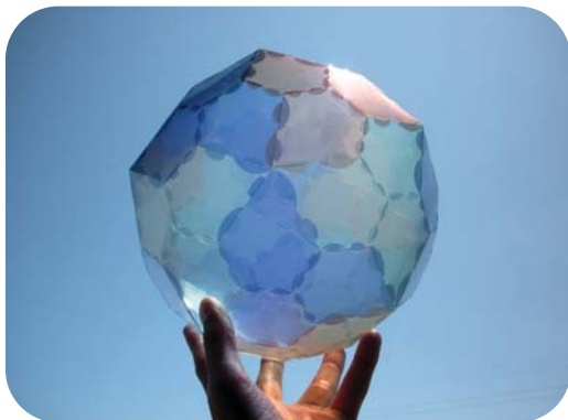
P60 60 parts