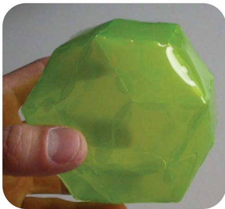
Triacontahedron 30 parts